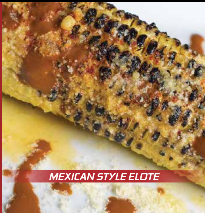
MEXICAN STYLE ELOTE

Fried Calamari, lightly breaded served with special sauce or ranch dressing.