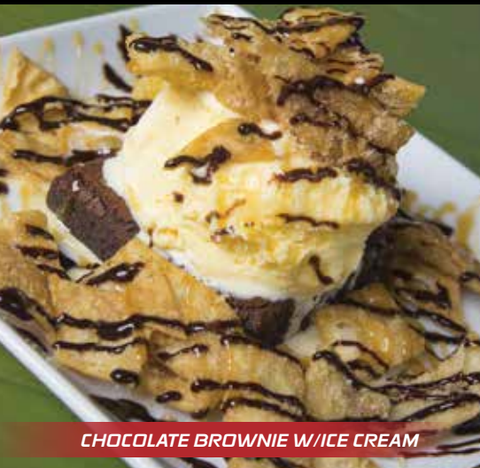
CHOCOLATE BROWNIE W/ICE CREAM