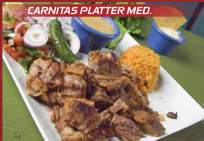
CARNITAS PLATTER MED.