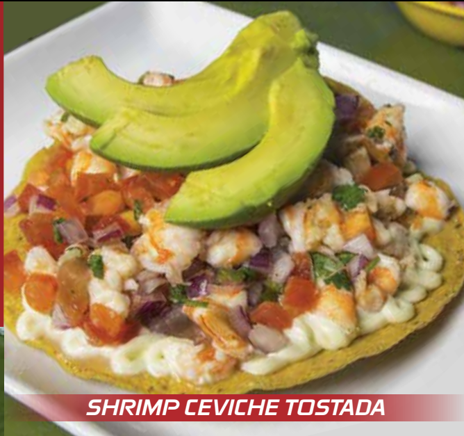
SHRIMP CEVICHE TOSTADA